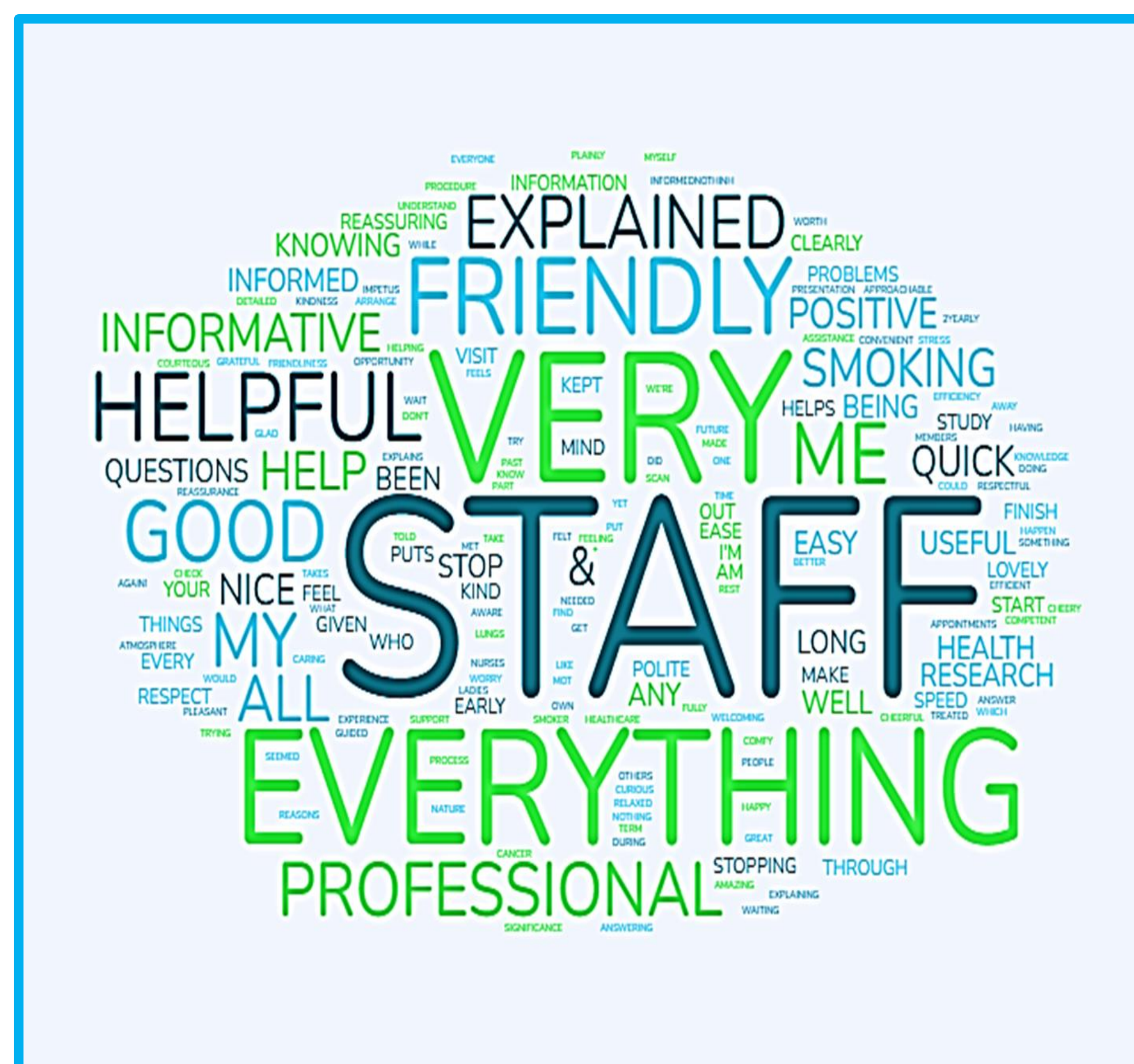
Participant Satisfaction Based on 140 Returned PRES